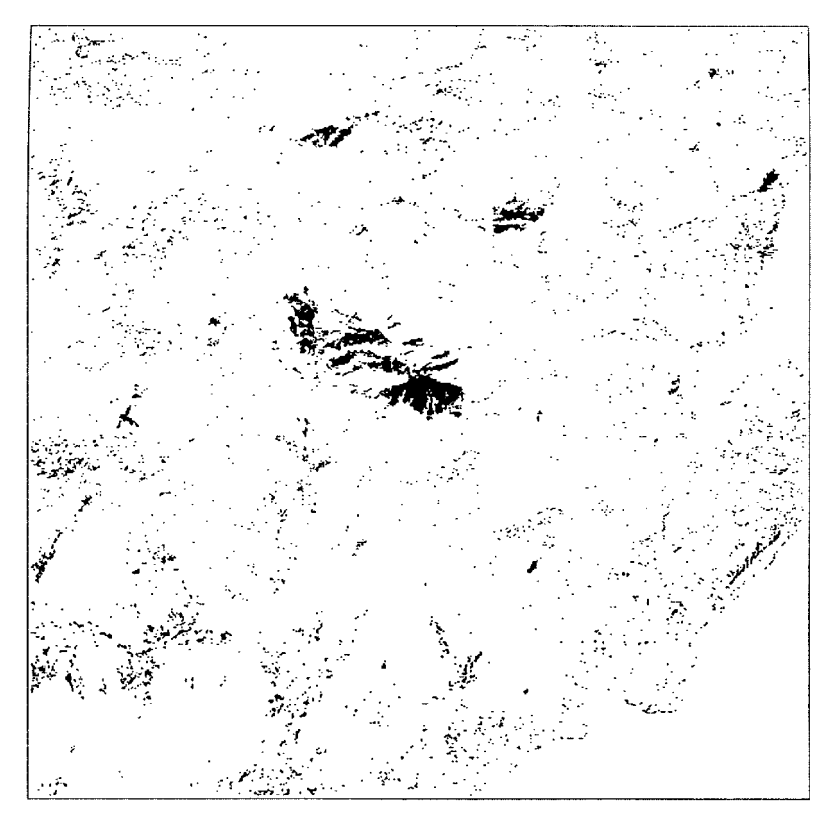
Figure 2. Map of changes provided by the proposed algorithm: 3710 pixels are missed in burned areas, 6032 pixels of false changes are detected in other areas.